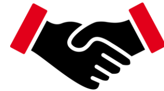
Civil Society Category